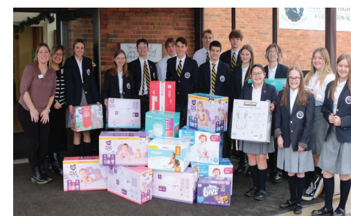
Holy Name High School competed with other Chesterton Academies to see who could collect the most diapers-our local chapter collected 3,190 diapers!