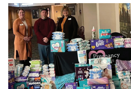
Lakeside Christian Church Lifemark movie diaper drive