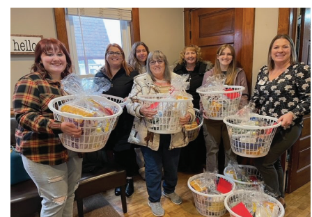
Escanaba Church of Christ provided material donations to new moms