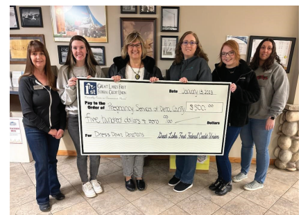
Great Lakes First Federal Credit Union Dress down day donation

Bark River Bible Church, St. Anne's Catholic Church, St. Anthony & St. Thomas Churches, St. Elizabeth Ann Seton Church and St. Joseph & St. Patrick Church