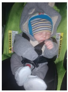
One of the many lives saved through the ministry!

All of the children and families pictured in these materials have been served by Pregnancy Services of Delta County.