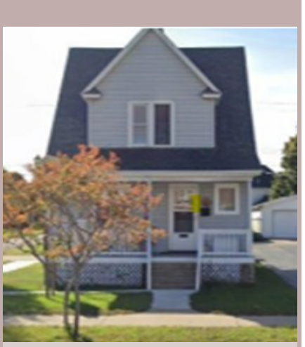
The former center 1801 Ludington Street, Escanaba