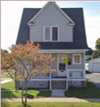
Our current home. 1801 Ludington Street, Escanaba.

In the years since 2015, the organization has continued to see growth by eventually hiring 3 staff members and expanding services by offering Man to Man mentoring, post-abortion support and a support group for those affected by miscarriage and early infant loss.